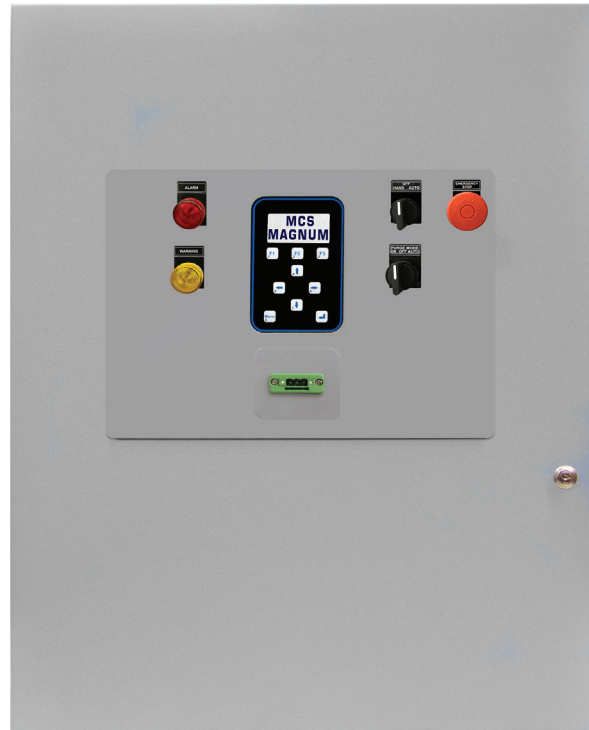
Photo shows MCS-RS-485-Extender mounted on front of enclosure

Size..... 5 foot Device Type..... RS-485 Weight ..... 0.1 lbs Operating Temperature Range ..... -40O to +85OC Max Bus Power Current ..... 250mA Data Transfer Rate ..... Up to 3Mbaud